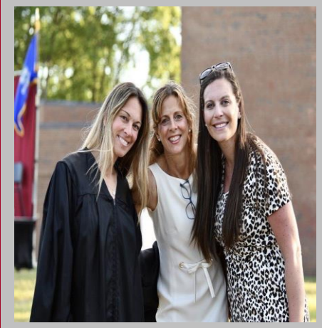
Windsor Locks High School Counseling Staff Members