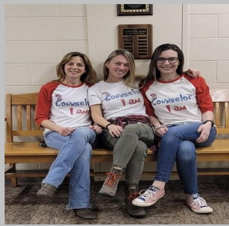
Windsor Locks High School Counseling Staff Members